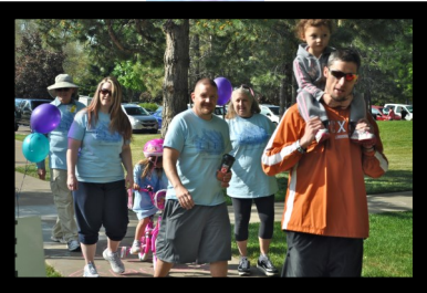
Walk for LIFE 2012 at Layton Park.