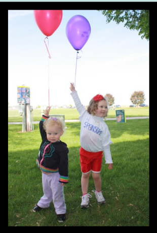
"Ready to get walking" at George Wahlen Park in Roy.

Go to www.ogdenpcc.org and click on the Walk banner to register today!